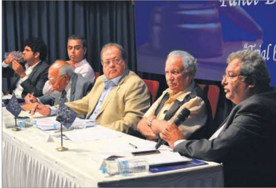
Esteemed panelists talk about Moot Court and its importance at the Jai Hind College Auditorium.